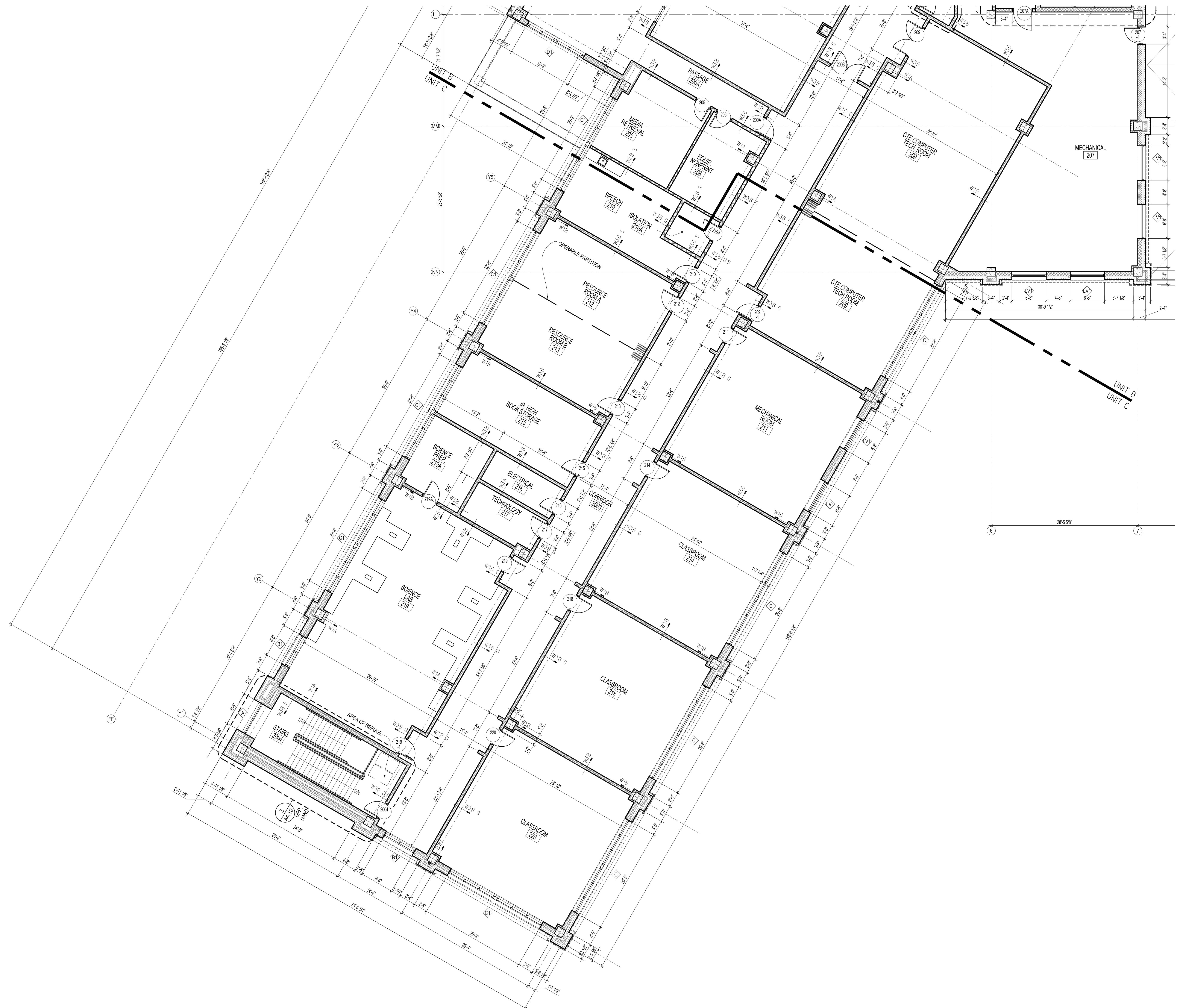
1 SECOND FLOOR PLAN - UNIT C A1.10 1/8" = 1'-0"