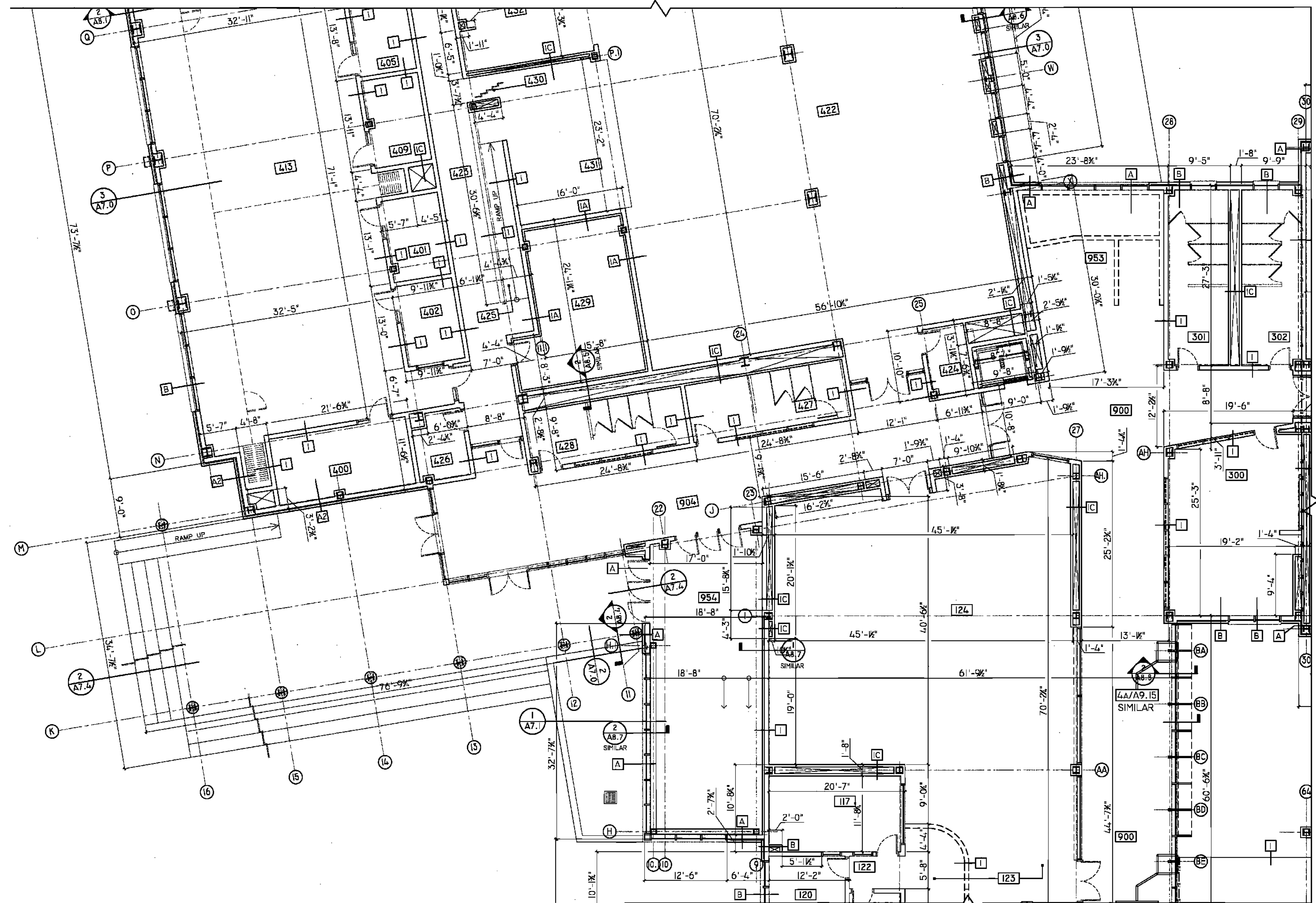
1 FIRST FLOOR PLAN 1/8" = 1'-0"